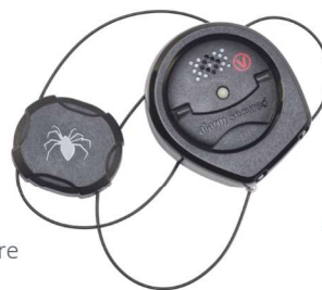
S3vx 2 Alarm Attack Spider Wrap

Auto-lock feature reduces number of steps required to apply