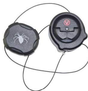
S3vx 2 Alarm Mini Spider Wrap

Aircraft grade cable for tough protection